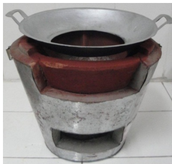
Figure 10: NLS A1 with a protective pot