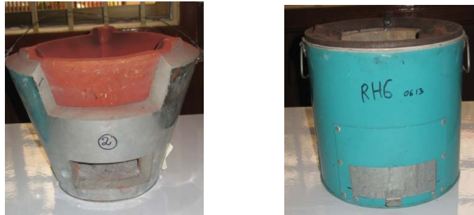
Figure 1: Pictures of the NLS (left) and the KhRoS (right)

The study is carried out on the New Lao Stove (NLS) A1, an adapted version of the Thai Bucket Stove that is able to use both charcoal and wood, and the Khmer Rocket Stove (KhRoS), an optimized charcoal stove recently developed by GERES as a result of the careful assessment of Cambodian user needs and habits.